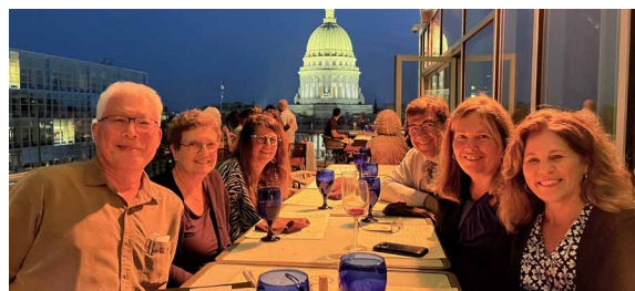
DCP and DMACC annual visit

On June 13 and 14, DMACC hosted colleagues from DCP and Frontier Science in Madison, WI for the annual site visit. This is the first in-person CP-CTNet meeting since October 2019. DMACC presented on many of the initiatives that have been in progress since funding first began and plans for the future to advance the goals and mission of CP-CTNet.